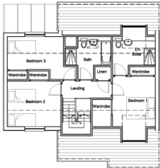
FIRST FLOOR PLAN 65,4 sqm