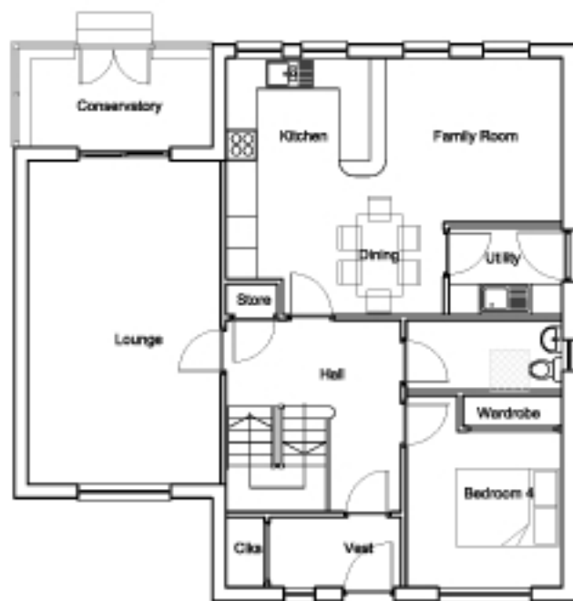
GROUND FLOOR PLAN 91.5 sqm